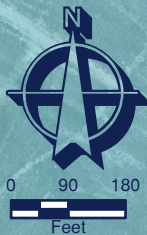
EXHIBIT "A" 20.014Z - ZONING MAP AMENDMENT Copper Ridge Estates, Phase II