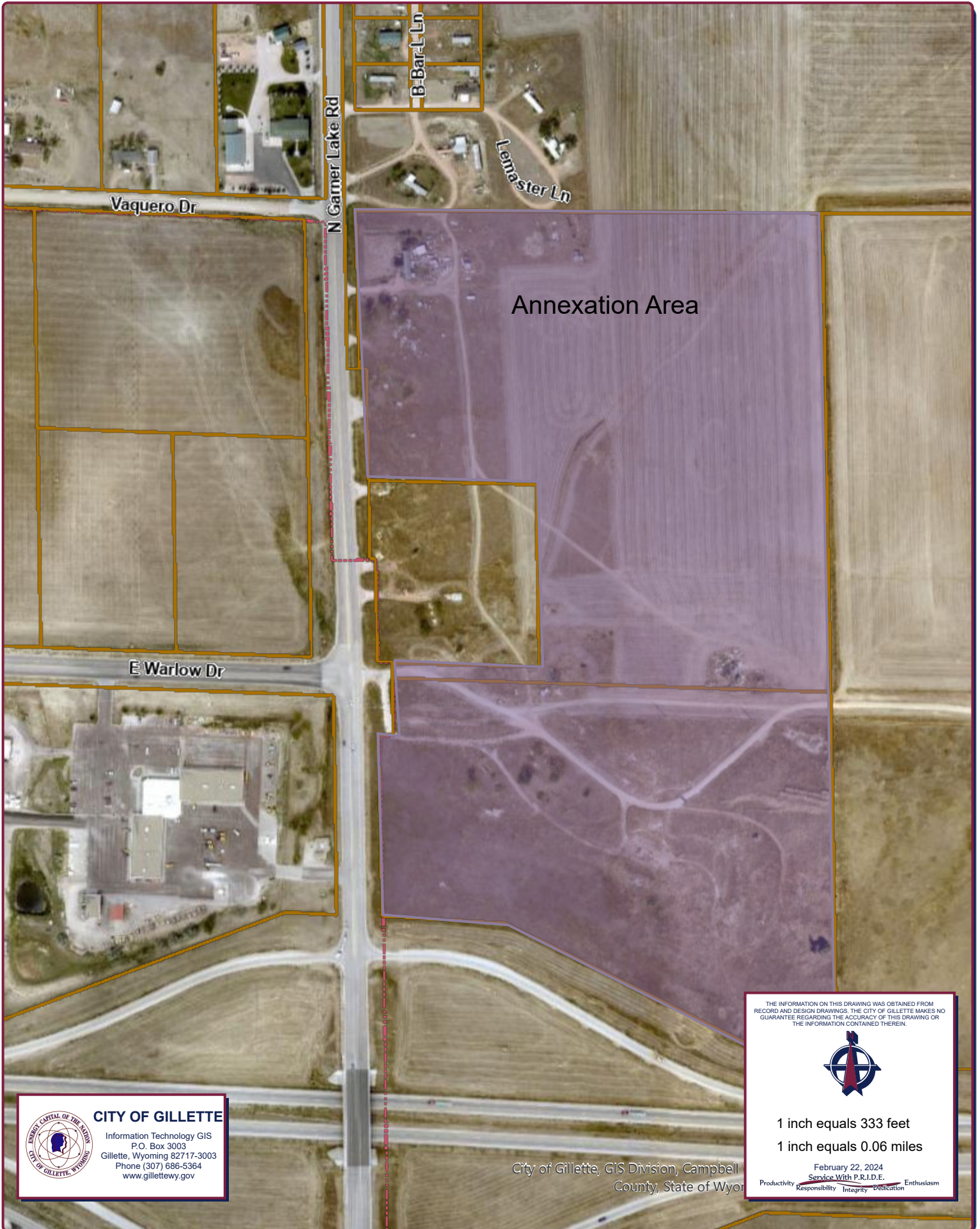
Exhibit A - Annexation Vicinity Map